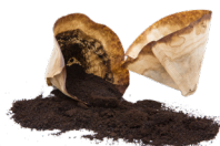
Coffee Grounds & Filters