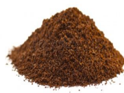
Coffee Grounds & Filters