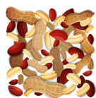
Grains, Seeds & Beans