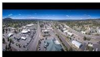
Bend Citywide Transportation Advisory Committee