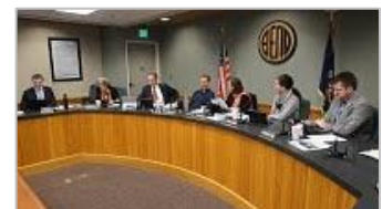
Bend City Council Goals