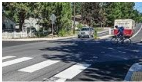
Neighborhood Street Safety Program