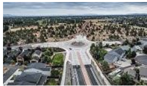
Empire Corridor Improvement Project